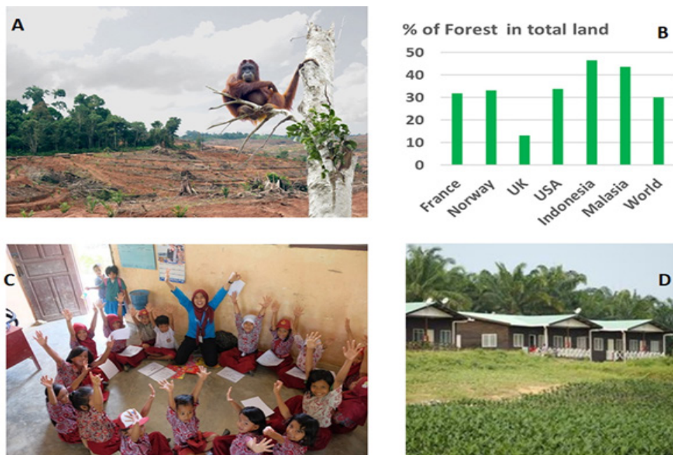
Figure 2. Effects of oil palm on environment and humans

soybeans. If all palm plantation is switched to soybean culture, it would need around eight times as much land. On the Earth, we do not have such big land to open up for plantation of another oil crop. No other oil-producing plants can replace the oil palm, and thus palm oil is unavoidable. Eliminating support for the companies trying to make palm plantation sustainable would give competitive advantages to the ones which care only about profits. Supporting the companies and smallholders who do not use forests for palm production will help make the sector more sustainable. If palm oil is banned from production of biofuels, millions of smallholders will lose their livelihoods, and another oil crop would cause much more deforestation and in turn result in more environmental and ecological problems.